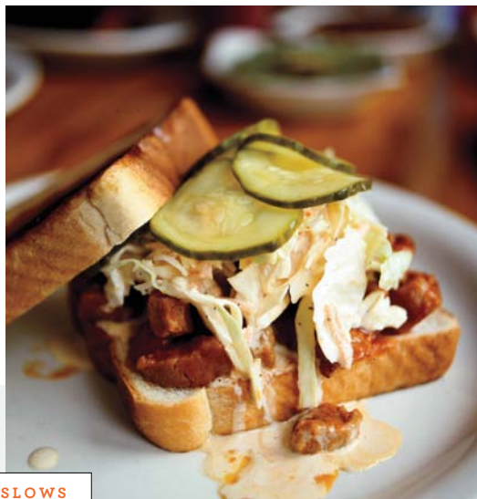
SLOWS BAR B Q

TRAVEL 411 Corktown is a 10-minute walk from downtown and a 30-minute cab ride from the airport.