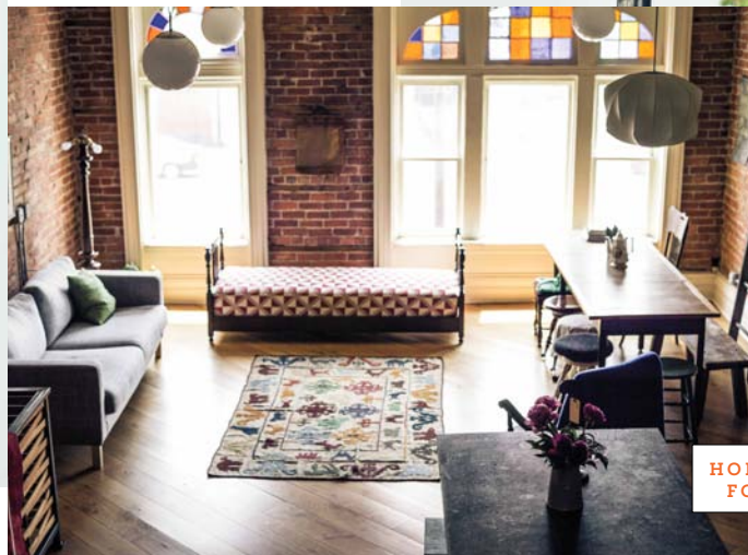
HONOR & FOLLY

SLOWS BAR B Q The ribs, brisket, and other smoky fare are stellar, and the patio overlooks Corktown's most photographed landmark: the city's famously beautiful (and long-abandoned) Beaux Arts train station. 2138 Michigan Avenue, slowsbarbq.com.