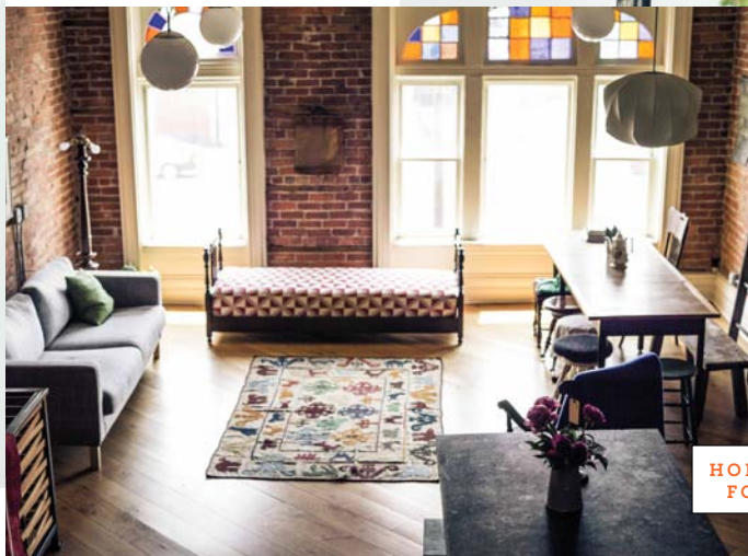
HONOR & FOLLY

SLOWS BAR B Q The ribs, brisket, and other smoky fare are stellar, and the patio overlooks Corktown's most photographed landmark: the city's famously beautiful (and long-abandoned) Beaux Arts train station. 2138 Michigan Avenue, slowsbarbq.com.